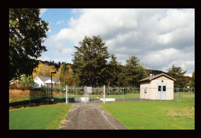
The Multiple Award-Winning